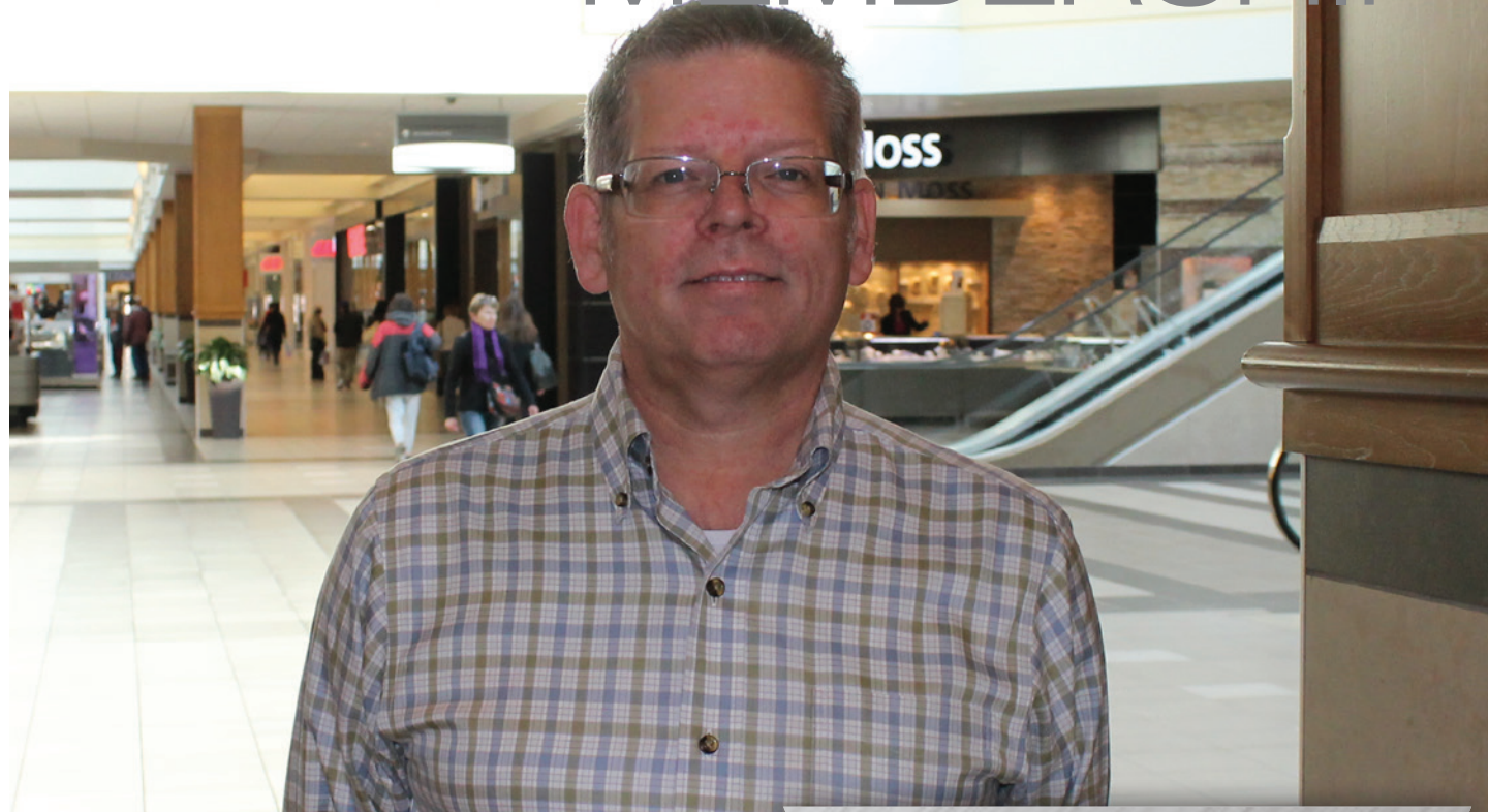
BOMA Member Since 1999