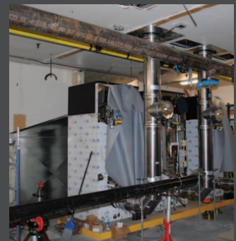
New high-efficiency condensing boilers

St. Vital Centre now has a composting program in place, as well as a comprehensive recycling program at the centre that recycles batteries and electronic waste.