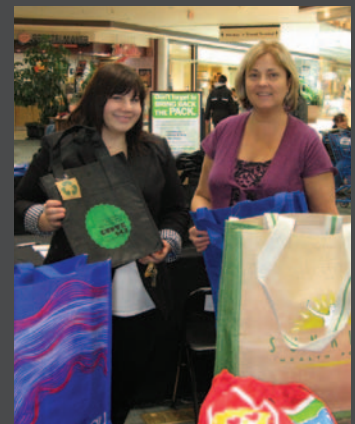
As part of St. Vital Centre's Green with Love program, 20 VIC staff promote green ways to shop on Reusable Bag Day