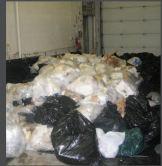
20 VIC hired Pinchin Environmental Ltd. to go through a day's worth of garbage, one item at a time, to find out what was going through the mall.