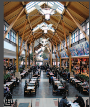
Skylights brighten space at St. Vital Centre's Food Hall

“ If an organization wants to show their commitment to sustainable building practices, a BOMA BEST designation is the best way to go. ”