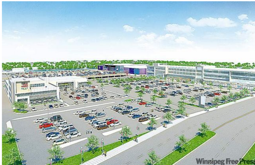
Enlarge Image

Artist's rendering of Polo North. The two buildings on the left are the former CTV/ WTN buildings. The three-storey building on the right is an Asian supermarket.